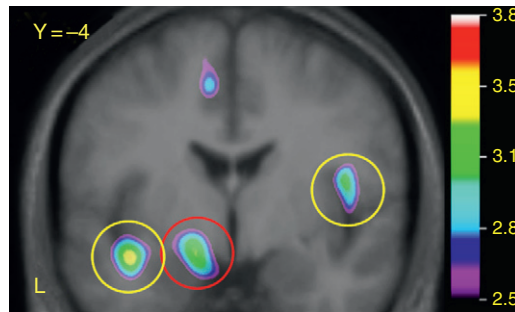
Figure 1.3 Group averaged rCBF response showed in statistical parametric map ( t statistics as represented by the color scale) to the processing of the body odor of a stranger. Yellow circles mark bilateral increased rCBF in the insular cortex and red circles mark increased rCBF response in the amygdala. Left in figure represents left side (L).

(a stranger) in the near vicinity, or a body odor originating from an individual in a fearful state, could be hypothesized to act as a warning signal which would be processed by the amygdala.